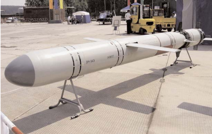
Figure 4 - Russian SS-N-27 'Club' Cruise Missile