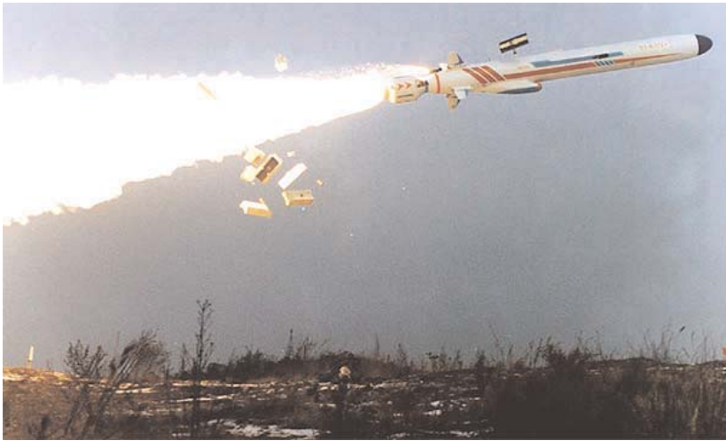
Figure 3 - Chinese C-802 Anti-Ship Cruise Missile

Source: "YJ-62 (C-602) Anti-Ship Cruise Missile," Chinese Defence Today , 2005, http://www.sinodefence.com/navy/navalmissile/yj621.asp