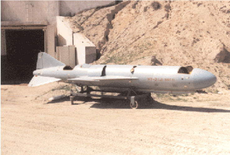
Figure 1 - Silkworm Missile at an Iraqi Storage and Maintenance Facility