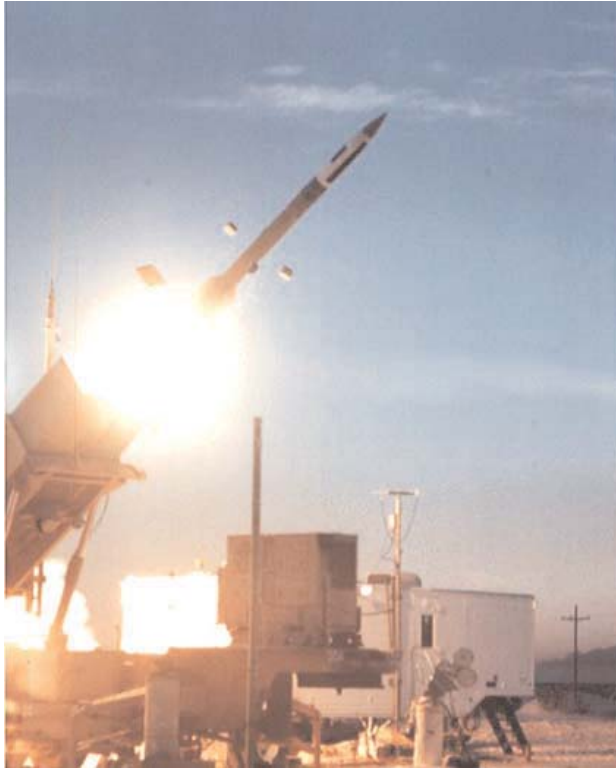
Figure 6 - Patriot PAC-3 Launch