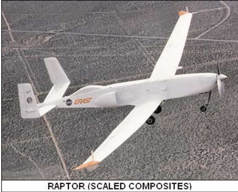
Figure 7 - U.S. Raptor-Talon BMD UAV